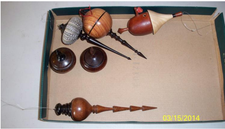
Some examples of Ken's finials

Some pictures from the March Hands-on session – Finials by Ken Thurman