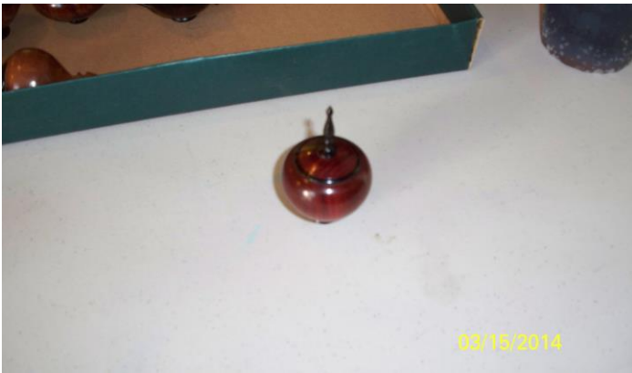
Ken's "I love you" box with finial