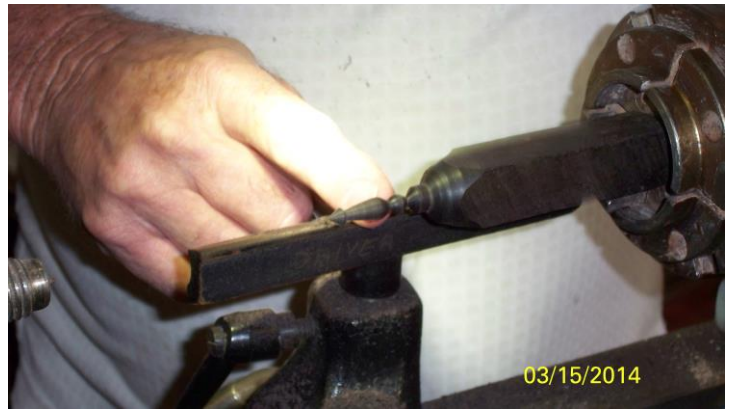
Small finial before being parted off