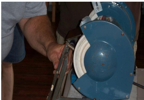
Oneway Wolverine Diamond Dressing Jig Both types are used to flatten the face of the grinding wheel. NOT to be used on CBN wheels.