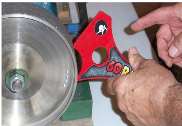
Raptor Set Up Tool – Used to determine correct angle for sharpening various tools, as shown in picture at right. 5 piece set has angles of 35, 40, 45, 50 & 60 degrees. (60 degree angle shown)